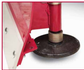
Adjustable cast iron skid shoe discs